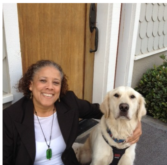
The woman who does it all!

Our staff members play a critical role in maintaining the everyday flow of Kids & Families Together. They are kind, nurturing and here to serve their community.