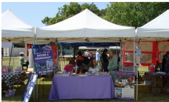
Dedicated K&FT peer mentors tabling at an event